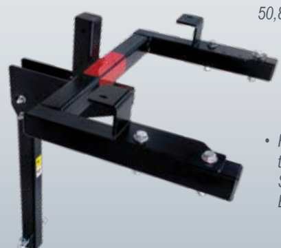
Mounting Kit for Electric Spreaders • Fits 2" receiver on UTV's to attach the Spyker S80-12010 Electric Spreader or LESCO Truckster2 Electric Spreader