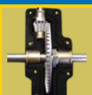
Fully Enclosed Metal Gears w/ Zerk Fittings