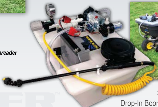
SPYDSS-9G Drop-In Boomless Sprayer with Wand Compatible with Spyker S100 Ride-On & S60-12020 Spreader, LESCO HPSCHARIOT & LESCO 101186/105821 Spreaders