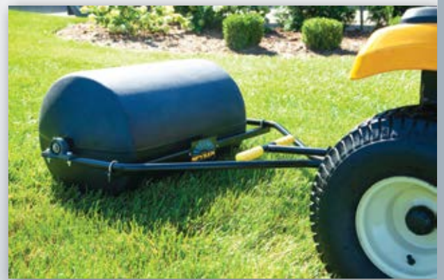
R28-1824 300 lb - Commercial Push/Tow Lawn Roller