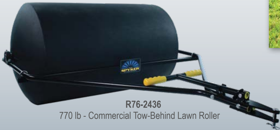
R76-2436 770 lb - Commercial Tow-Behind Lawn Roller