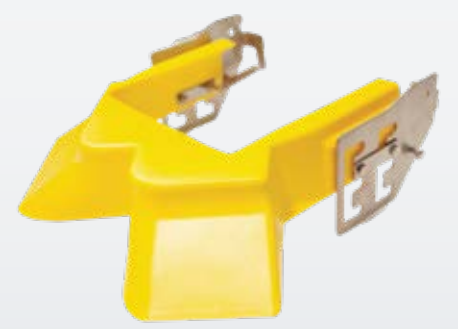
Variable Deflector Kit • Adjustable Spread Width from 3-12 feet • Stores on spreader • Stainless steel hardware • Compatible with the Spyker ERGO-PRO™ 50,80, and 100 lb. models