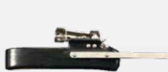
Side Deflectors • Prevents spread on walks, planting beds, etc. • Spring loaded