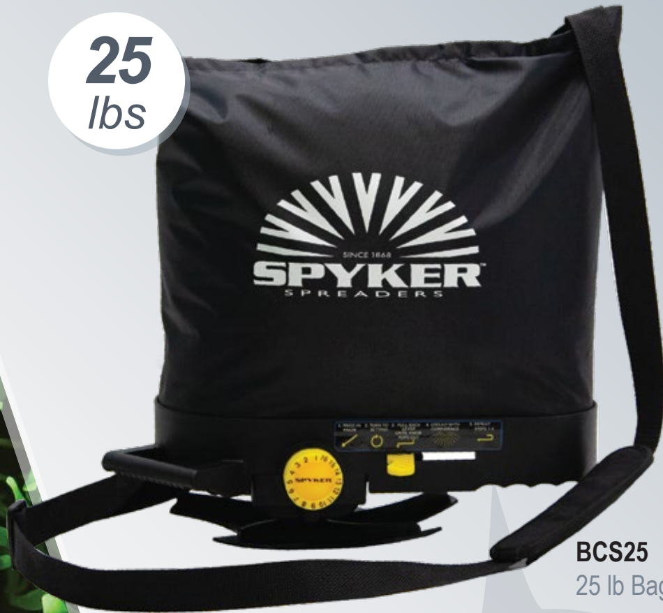
BCS25 25 lb Bag Spreader

Back view with clear material viewing window