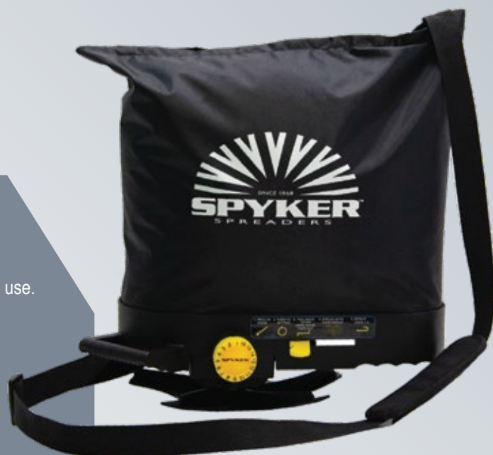
BCS25 25 lb Bag Spreader