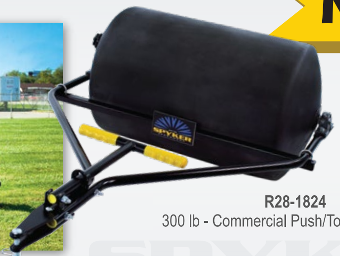
R28-1824 300 lb - Commercial Push/Tow Lawn Roller