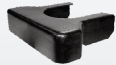
Full Deflectors • Perfect for ice melt and bagged salt • 3 feet wide controlled spread pattern