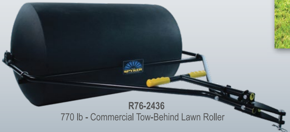
R76-2436 770 lb - Commercial Tow-Behind Lawn Roller