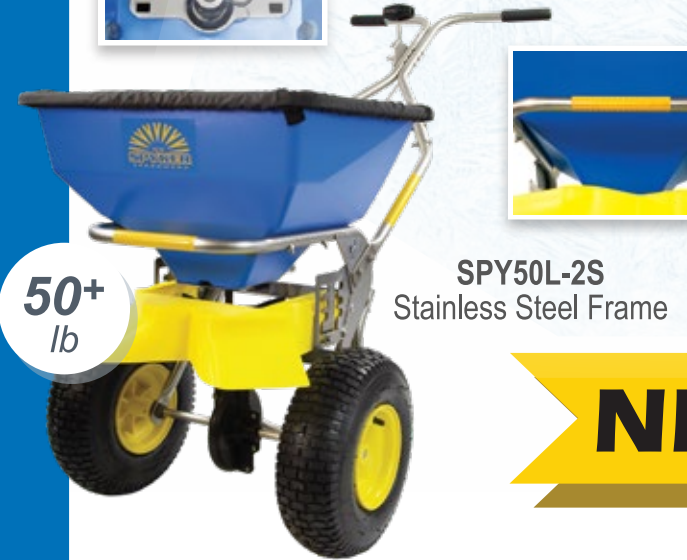
SPY50L-2S Stainless Steel Frame