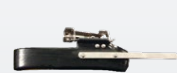
Side Deflectors • Prevents spread on walks, planting beds, etc. • Spring loaded