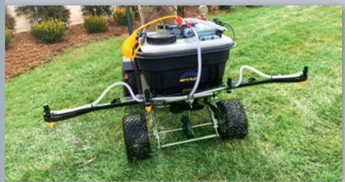
SPYDSB-9G Drop-In Sprayer with Breakaway Booms Compatible with: Spyker S100 Ride-On, LESCO HPSCHARIOT & LESCO 101186/105821 Spreader