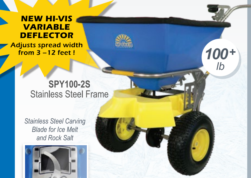
SPY100-2S Stainless Steel Frame

NEW HI-VIS VARIABLE DEFLECTOR Adjusts spread width from 3 - 12 feet!