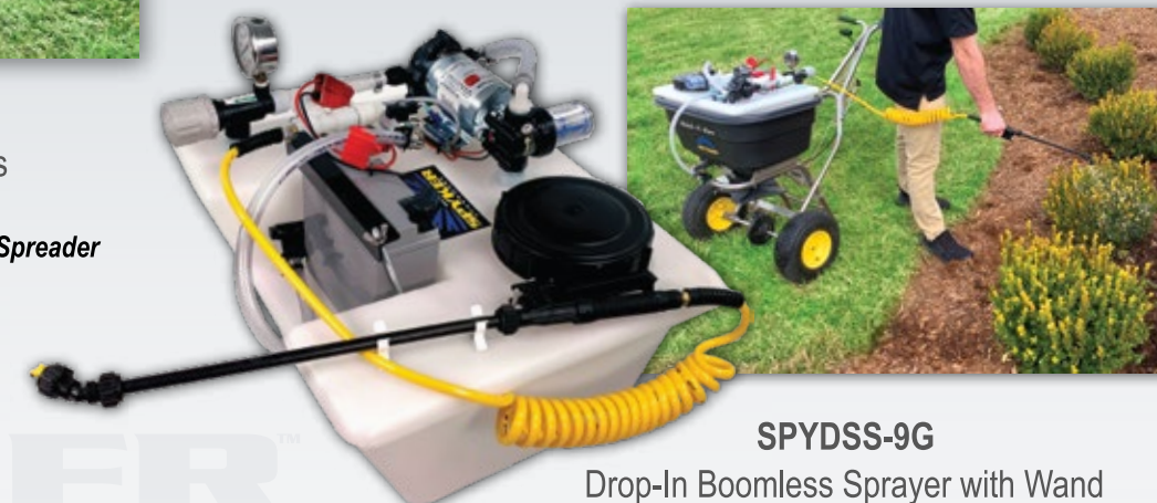
SPYDSS-9G Drop-In Boomless Sprayer with Wand Compatible with Spyker S100 Ride-On & S60-12020 Spreader, LESCO HPSCHARIOT & LESCO 101186/105821 Spreaders