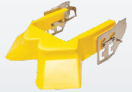
Variable Deflector Kit • Adjustable Spread Width from 3-12 feet • Stores on spreader • Stainless steel hardware • Compatible with the Spyker ERGO-PRO™ 50,80, and 100 lb. models