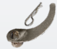
Agitator Blade • HD 16 ga. Stainless Steel • For use with rock salt and heavy material