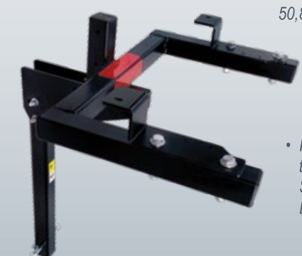
Mounting Kit for Electric Spreaders • Fits 2" receiver on UTV's to attach the Spyker S80-12010 Electric Spreader or LESCO Truckster2 Electric Spreader