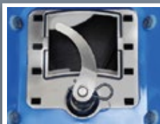
Stainless Steel Carving Blade for Ice Melt and Bagged Salt