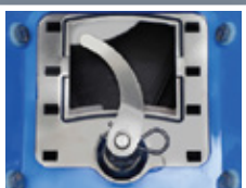
Stainless Steel Carving Blade for Ice Melt and Bagged Salt