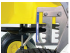
Includes Hi-Vis Variable Deflector